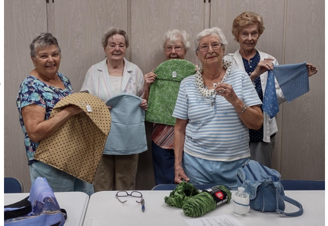
Our crafters displaying COOL TIES and WHEEL COVERS, items that make desert living a little easier.

Both of these items are very inexpensive and can be lifesavers. Do check out our TABLE in King Hall next time you come for Coffee Hour or a Meeting. —Bonnie Green