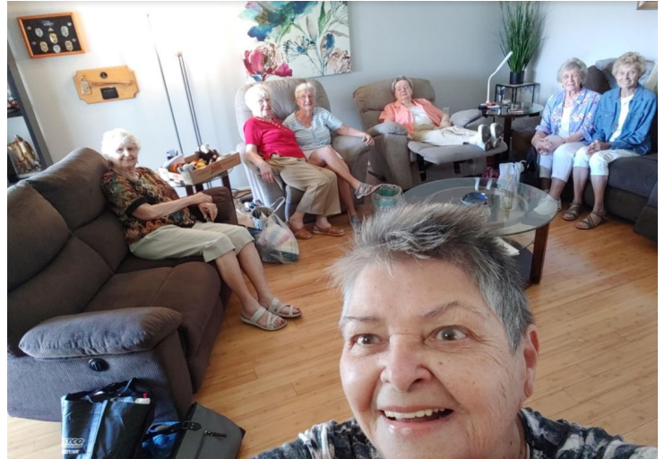
A recent gathering of the Service Project Craft Group.