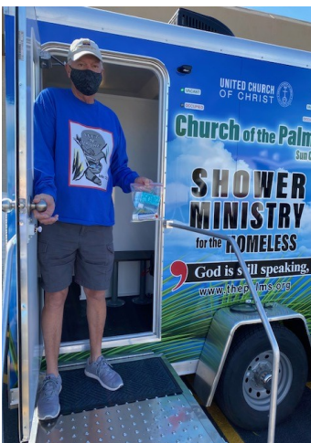
God is Still Speaking

The City of Surprise and the Salvation Army are wonderful and generous partners as we work together to care for the homeless in our communities. We look forward to working together on the 2nd and 4th Tuesdays of each month. We anticipate our numbers will increase as people come to know that we are safe and practicing extravagant hospitality.