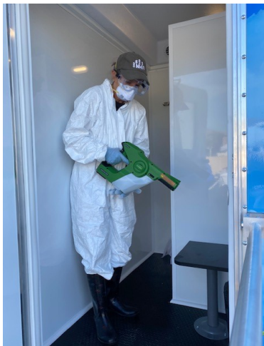
Church of the Palms