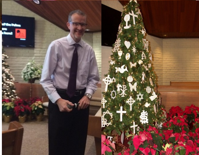
The Church of the Palms Christmas 2016